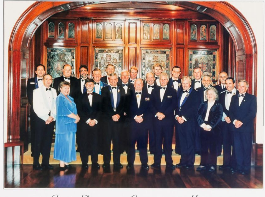
State Dinner, Government House Adelaide 27 April 1999

AUSTRALASIAN CONFERENCE ON DRUGS STRATEGY